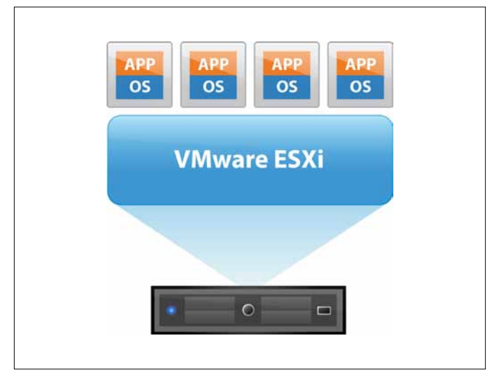
Figure 1. Server Consolidation with VMware vSphere

A key benefit of virtualization technology is the ability to contain and consolidate the number of servers in a datacenter. This allows businesses to run multiple application and OS workloads on the same server. Ten server workloads running on a single physical server is typical, but some companies are consolidating as many as 30 or 40 workloads onto one server. As you might expect, dramatically reducing server count has a transformational impact on IT energy consumption. Utilization of x86 servers increases from the typical 8-15 percent to 70-80 percent. Reducing the number of physical servers through virtualization cuts power and cooling costs and provides more computing power in less space. As a result, energy consumption typically decreases by 80 percent.